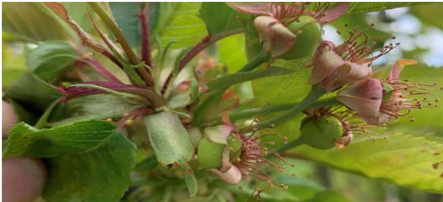
BBCH 72: green ovary surrounded by dying sepal crown, sepals beginning to fall

Use Premio in a program. Begin applications from fruit set onwards, i.e. crop stage BBCH 72: green ovary surrounded by dying sepal crown, sepals beginning to fall. Continue applications at an interval no greater than 10–15 days. Ensure an application is made 14 days prior to harvest. Can be used up to the time of harvest.